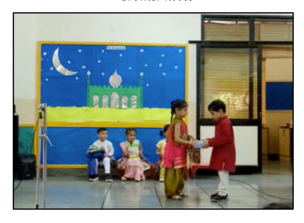
Last but not the least comes Jashn-e-Eid. Children danced with enthusiasm to the melodious qawwali "Mubarak, Eid Mubaarak......".

The essence of Eid is 'Charity' to help people in need and celebrate brother hood.