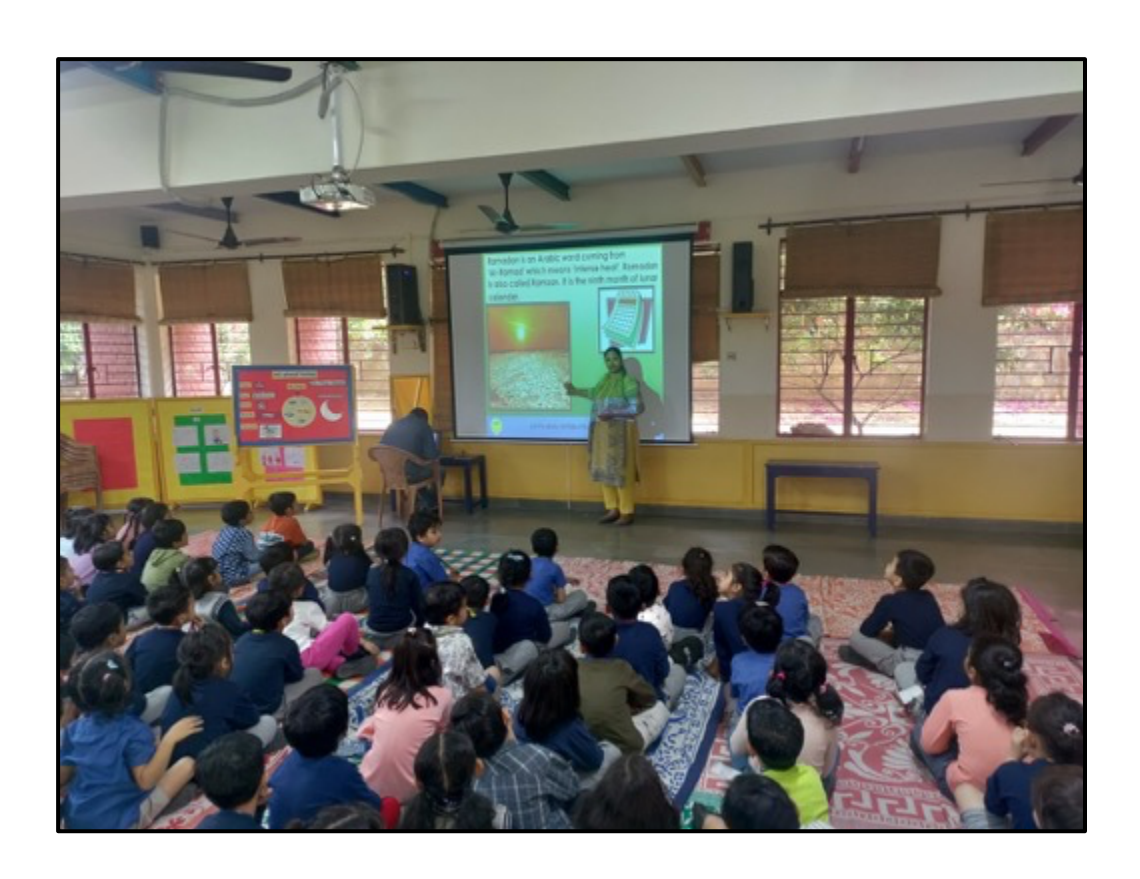
Prior to Eid a presentation was shown on the fasting month of Ramzan.

Eid which is an Arabic word means festivity, while Fitr means to break a fast. Eid-ul-Fitr is celebrated at the end of the fasting month of Ramzan. It is a festival of fast breaking and sharing the abundance.