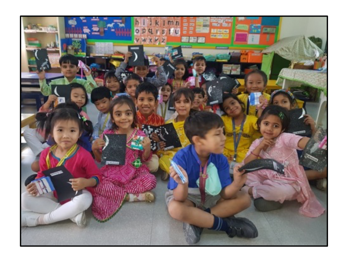
The true spirit of Eid was celebrated by Santa Marians when they hugged and wished each other 'Eid Mubarak'.